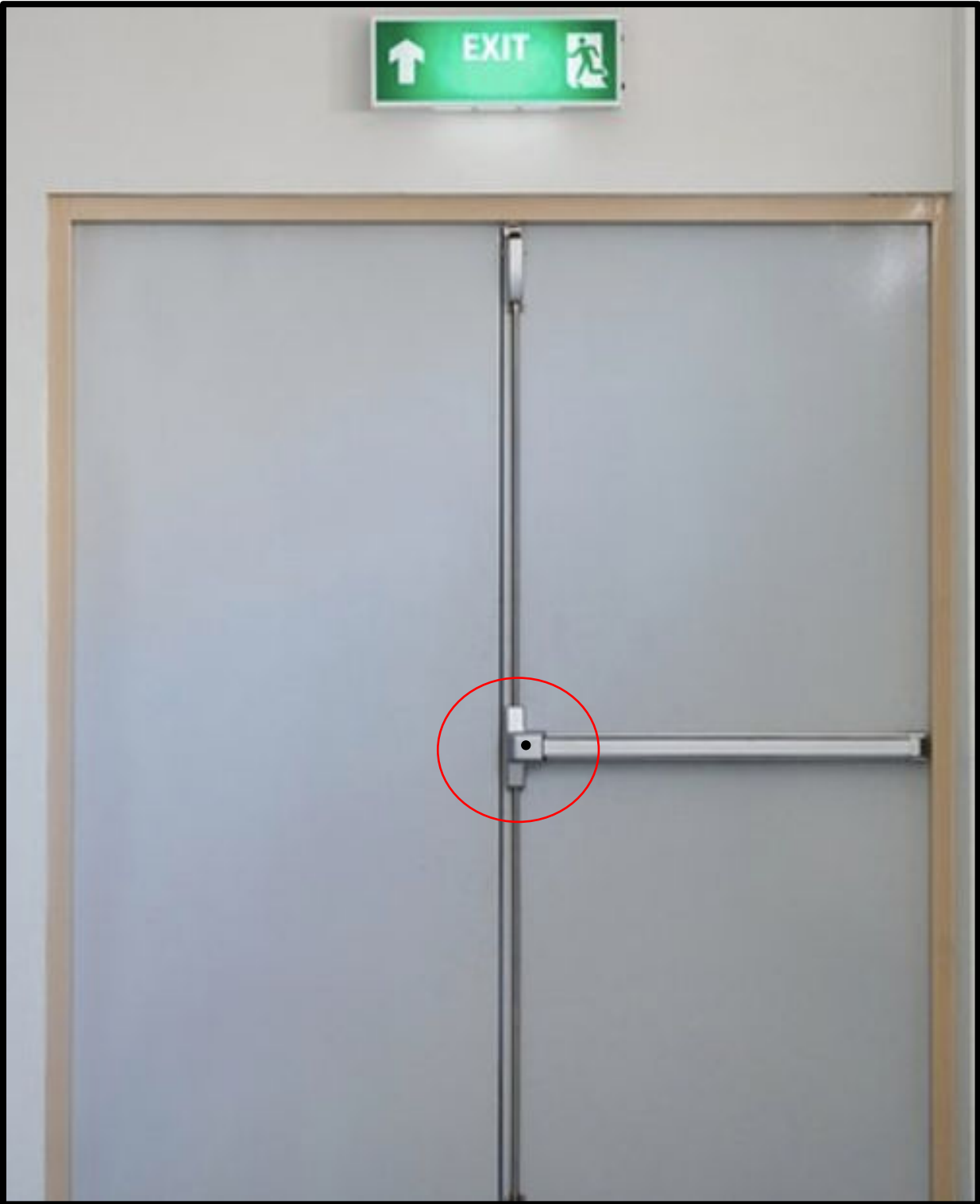
Exhibit #10: Picture - Double Doors with Push Bar

Note: The red circle is circled around the pass key hole where guitar string was found.